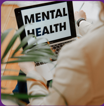
Mental Health printable & apps