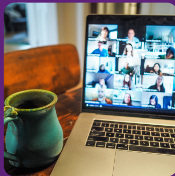
Virtual gatherings with friends