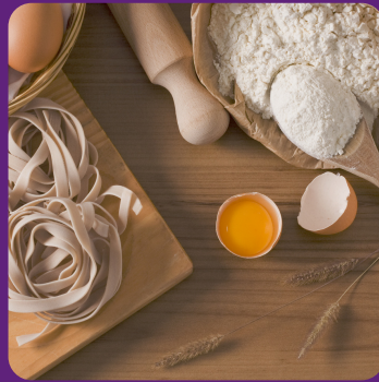
Cook / Bake