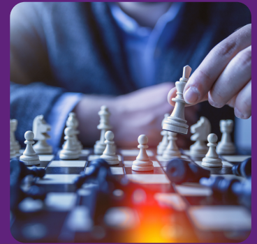
Play board games/puzzles