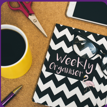
Do jobs you've been meaning to do.