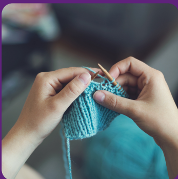
Learn a craft on YouTube – knitting, crocheting, needle felting